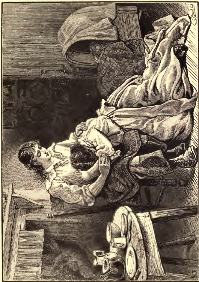
She drew the curly head upon her lap.